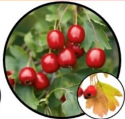
HAWTHORN Crataegus monogyna Small, oval haws in bunches