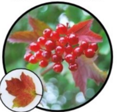
GUELDER ROSE Viburnum opulus Clusters of red oval berries