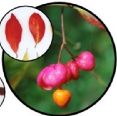
SPINDLE Euonymus europaeus Bright pink fruits & orange seeds