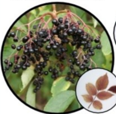
ELDER Sambucus nigra Clusters of small black berries