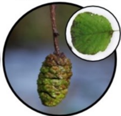
ALDER Alnus glutinosa Green and brown cones