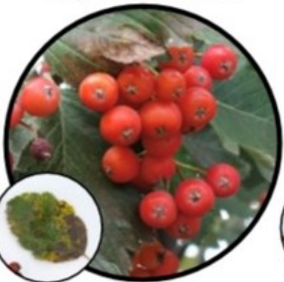
WHITEBEAM Sorbus aria Clusters of large red berries