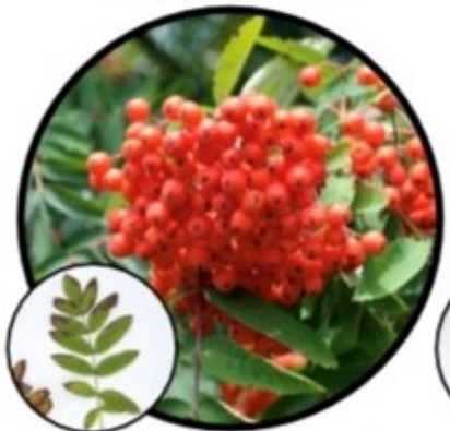
ROWAN Sorbus aucuparia Clusters of small red berries