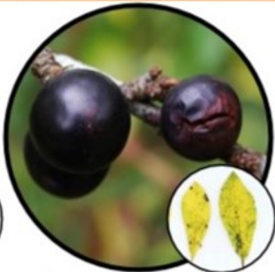
BLACKTHORN Prunus spinosa Large, round sour sloes