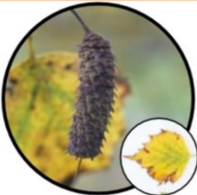
BIRCH Betula spp. Scaly brown catkins